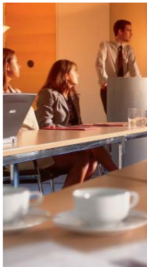
A typical Regus Meeting Room