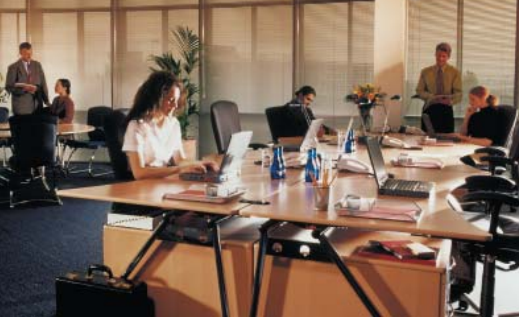
A typical Regus Office