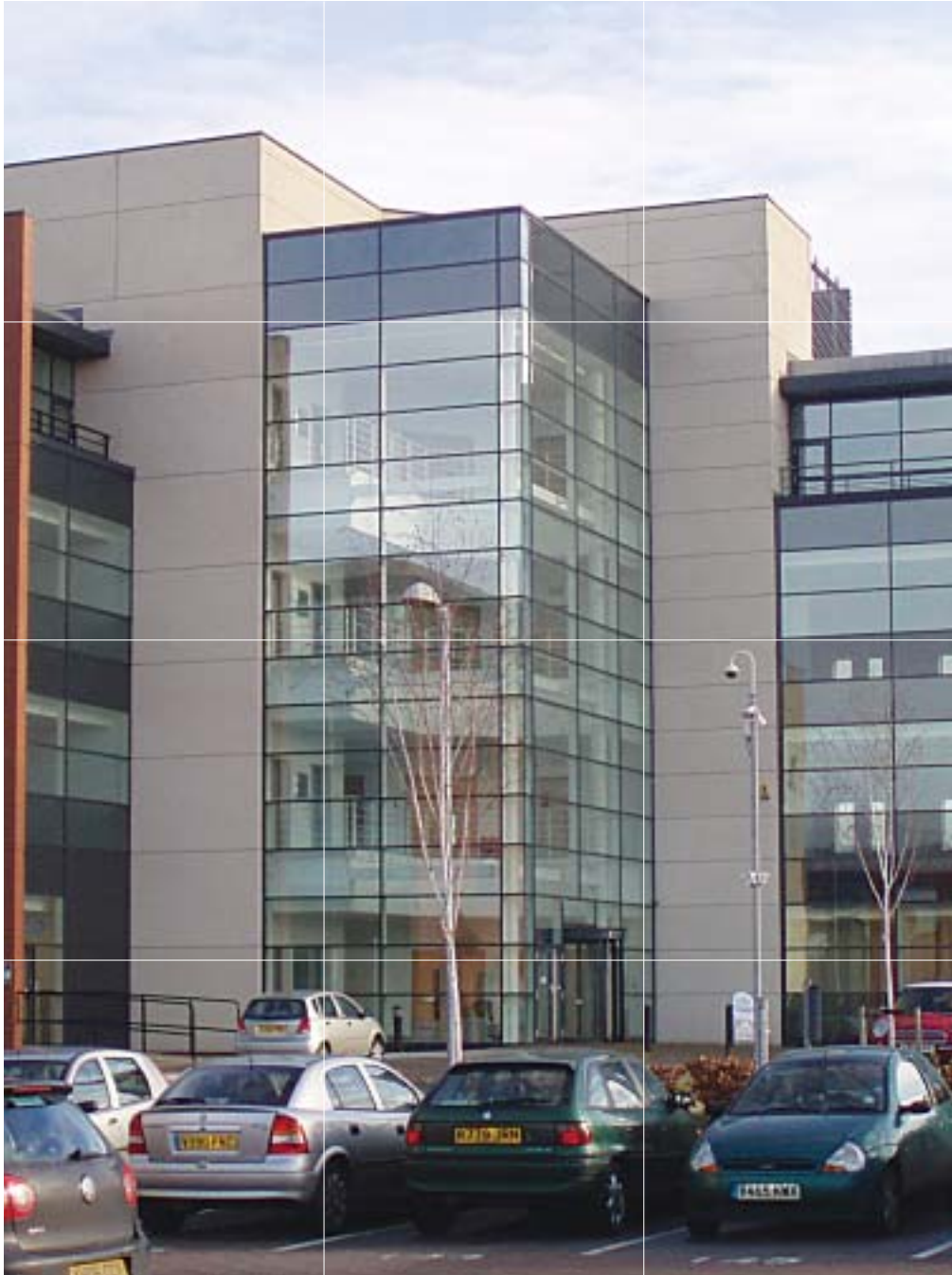
City West Leeds