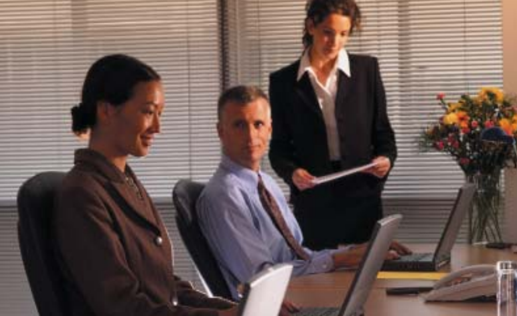
A typical Regus Office