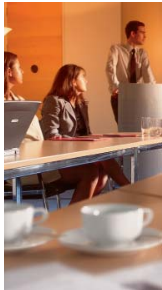
A typical Regus Meeting Room