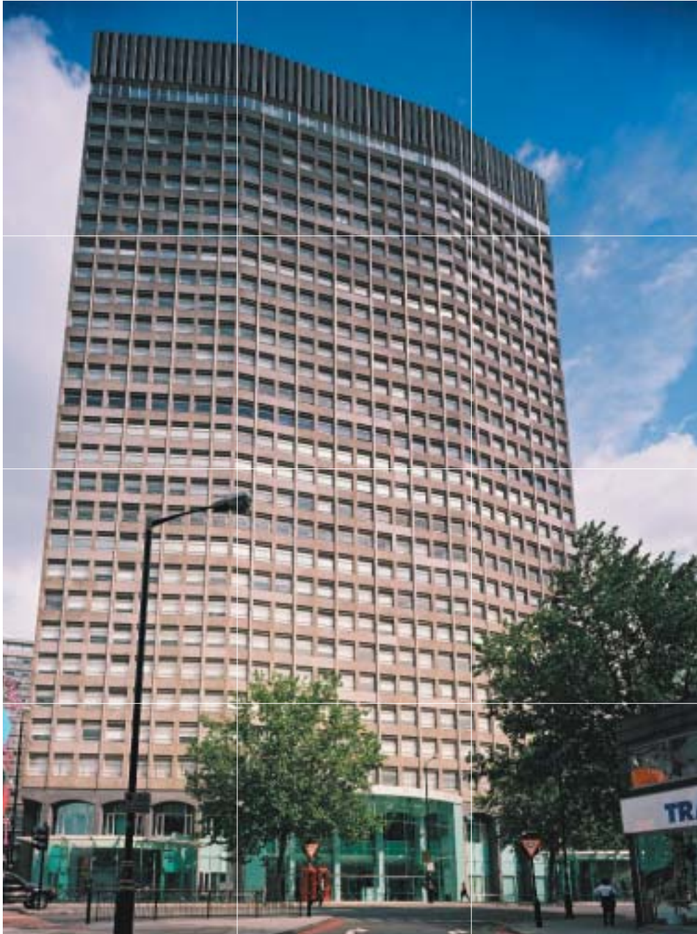
Victoria London SW1